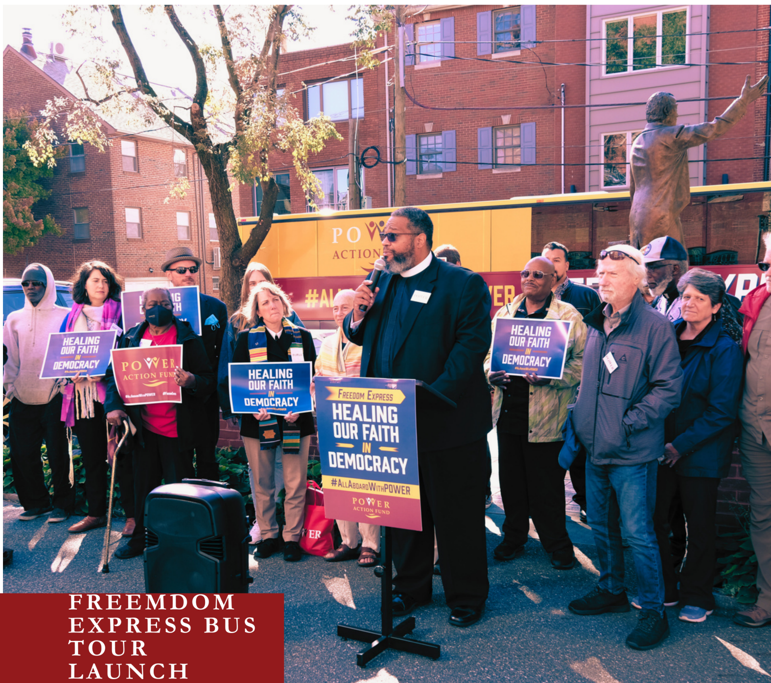
FREEDOM EXPRESS BUS TOUR LAUNCH